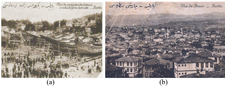
Figure 3: (a) Wooden ship building in the old quay district [10]; (b) Compact historical urban texture in the past [10].