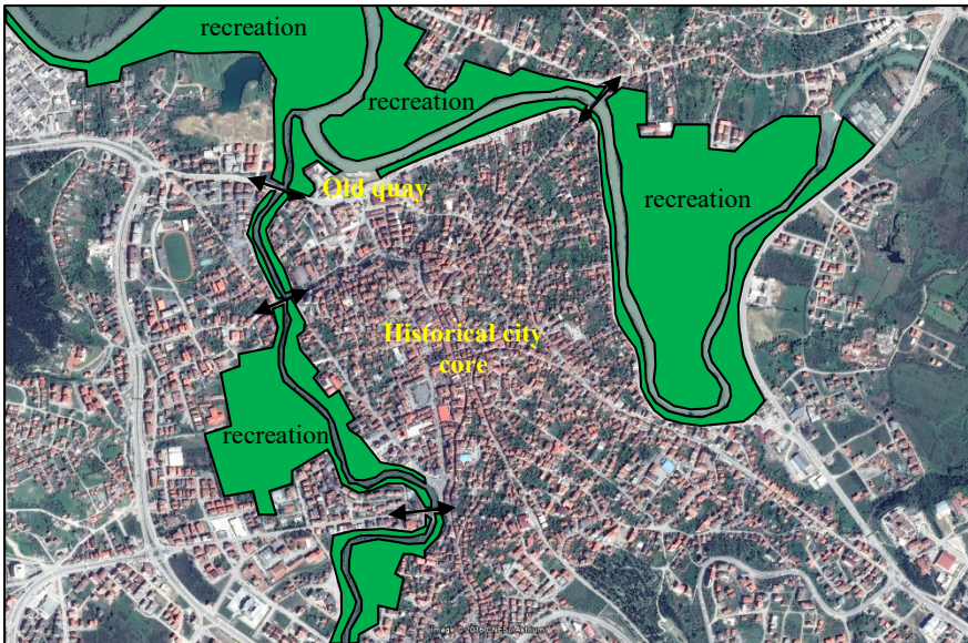
Figure 6: Green spaces proposal on riversides of peninsula in city core.

In Parthenia, people living in a residential area on the peninsula or visitors coming to that place cannot be aware of where they are – on a peninsula surrounding the river or on a lowland from a geographical aspect. Thus, green spaces (including green corridors and green ways) integrated with the whole green