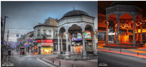
Figure 5: Monumental fountain as a landmark in the city [11].