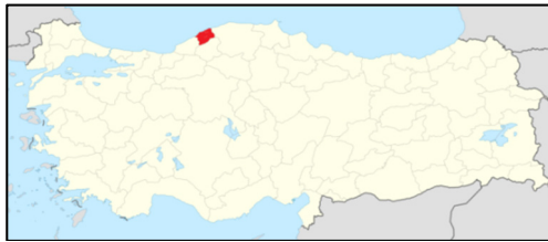
Figure 1: Location of Bartın (Parthenia) in Turkey.

The city of Bartın in Turkey is located in north Anatolia, near the Black Sea (figure 1). As one of the most ancient settlements in the Paphlagonia region [6], Bartın which was called Parthenia in ancient times [7], is one of the special cities in Turkey which has a river passing through. It is mentioned in written sources that the name of the settlement on the riverside of Bartın River was Parthenia in ancient times and then it changed to Bartın in time [7]. As major factors which constituted the settlement and shaped its form, there are two important heritages in Parthenia. The first of them is Bartın River which was called Parthenios in the past, and it is also mentioned in historical sources that it was named after the Greek poet: Parthenios who lived in Parthenia [8]. The second heritage from the past is the historical city core in historical urban texture in which there are a lot of traditional architecture samples.