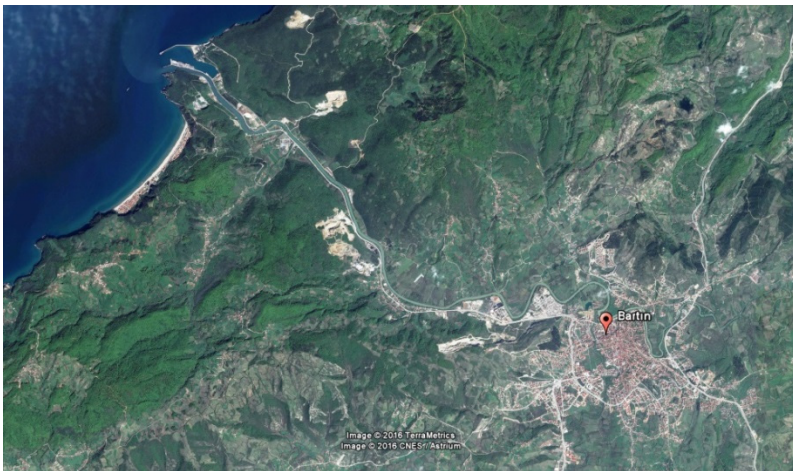
Figure 2: Parthenia and Parthenios extending over the Black Sea.