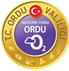
REPUBLIC OF TURKEY ORDU GOVERNORATE