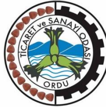
ORDU CHAMBER OF COMMERCE AND INDUSTRY