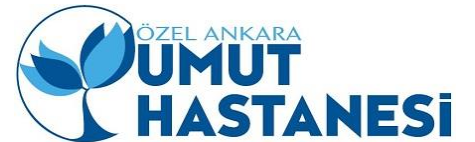
ÖZEL UMUT HOSPITAL