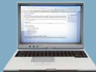
Table of contents Podcasts Ahead of Print CME Specialized topics

Sign up to receive emailed announcements when new podcasts or articles on topics you select are posted on our website.