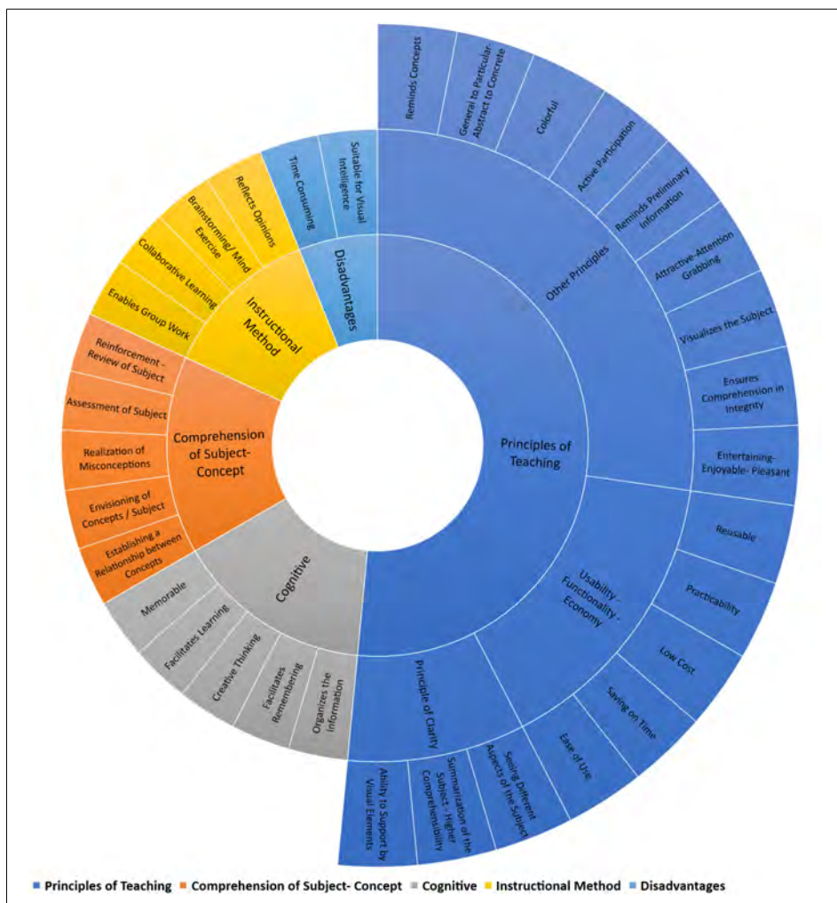
Fig. 6. Opinions on the Use of Mind Mapping During Learning-Training Processes.

Examining Fig. 6, the PSTs mostly reported positive comments on the instructional benefits of the mind maps in particular; on the other hand, there are some negative