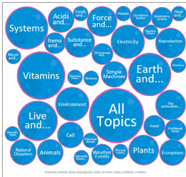
Fig. 14. Schematic Display of Science Course Subjects, Where WT-IMM Can Be Used.

As seen in Fig. 14, most of the PSTs stated that the DMMs can be used for all topics in Science class. Nevertheless, the topics “ Vitamins ”, “ The Earth and the Universe ” and “ Systems ” were particularly emphasized among 36 different topics stated by the PSTs ( f_{\text{ScienceClass}} = 120 ). Additionally, the answers given by the PSTs for which topics or purposes the DMMs can be used other than the Science class were similarly analyzed and shown by word cloud in Fig. 15.