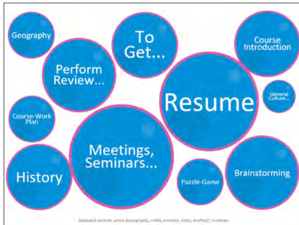
Fig. 15. Schematic Display of Non-Science Course Subjects or Purposes of Use, Where WT-IMM Can Be Used.

As shown in Fig. 15, most of the PSTs stated that they would use the DMMs for their Meetings, Seminars and Presentations. On the other hand, the most commonly stated comments included that they could prepare their own Resumes, Brainstorming and Perform Review of Topics by using the DMMs. Below (Fig. 16) are some of the statements made by the PSTs in relation to the fifth sub-problem: