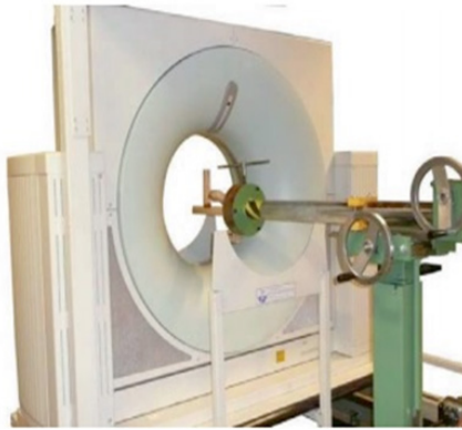
Figure 2: CT- scanner.