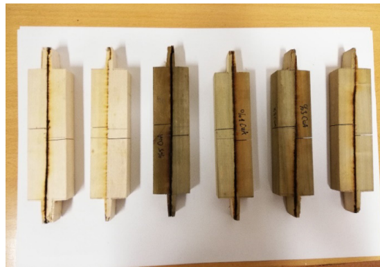
Figure 1: Shear strength test samples.

Specimens composed of two pieces of Scots pine ( Pinus sylvestris L.) each of dimensions 200 mm × 20 mm × 20 mm were welded together to form a bonded specimen of dimensions 200 mm × 20 mm × 40 mm by a vibration movement of one wood surface against another. The samples were welded in the longitudinal wood grain direction. The specimens were cut according to the method described in European standard EN 302-1 (2013) for bonded wood joints with a welded overlap of 1 cm along the length of the joint and 2 cm width. The strengths of the joints were measured using an Instron universal testing machine at a rate of 2 mm/min (Figure 1).