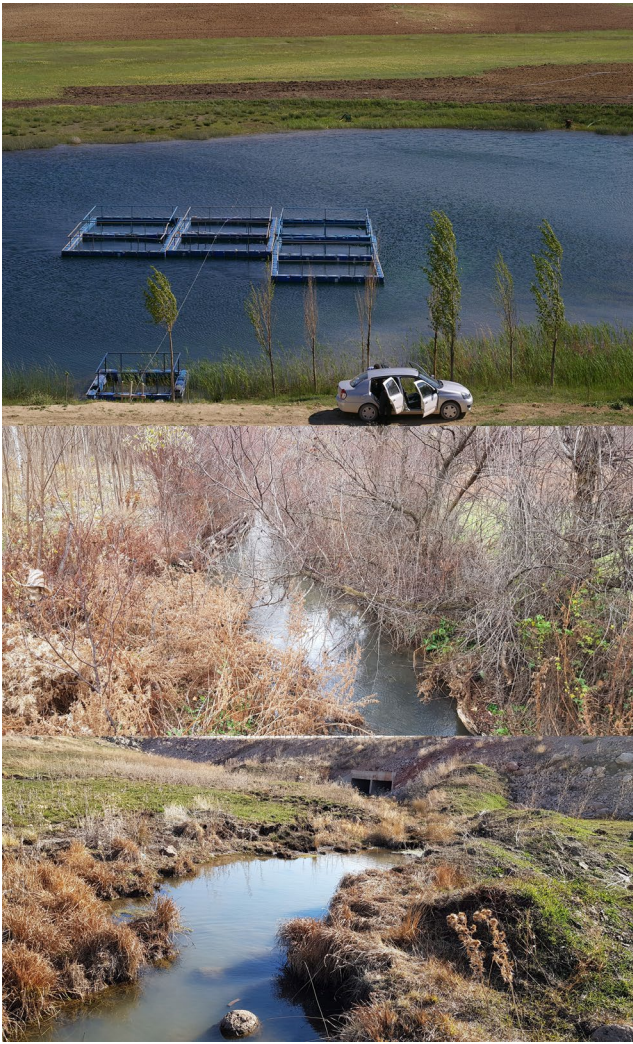
FIGURE 4 Habitats of Pseudophoxinus firati , from above: spring Yazıyurdu, spring Göz, spring Karahalka

Kaynağı) were known and the species was believed to decline. The enhanced information on the distribution of P. firati offers the opportunity for a re-assessment of the conservation status following the IUCN criteria. The extent of occurrence (EOO) of the species is estimated to be at least 37.100 km 2 and the species is now known from eight independent populations. All these eight populations inhabit very small areas and the area of occurrence (AOO) is believed to be smaller than 40 km 2 . However, it might be more widespread in the Gökşun River drainage, which is a tributary of the Ceyhan. More populations are expected to be found in the future and the species might qualify as Least Concerned, but still it qualifies as Vulnerable following the IUCN Red List Criteria ( https://cmsdata.iucn.org/downloads/redlistguidelines.pdf ). There are many threats in the area and the population in the stream Süt Kaynağı could not