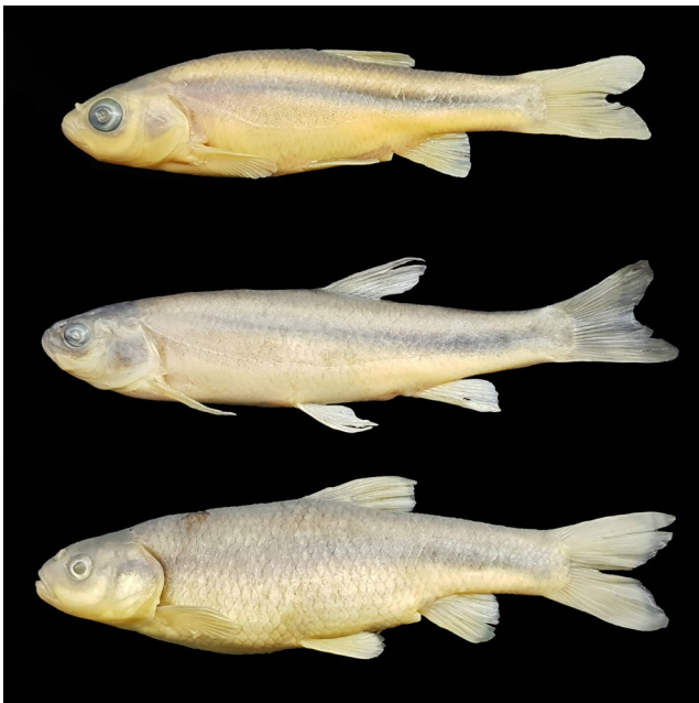
FIGURE 2 Pseudophoxinus firati , from above: IUSHM 37600-229, 52 mm standard length (SL), spring Yazyurdu; FCMG 2015-08, 80 mm SL, spring Karahalka; FCME 2008-03, 98 mm SL, stream Süt Kaynağı

We expect that more populations of this species to be discovered, especially in the area, where the watersheds of the Euphrates,