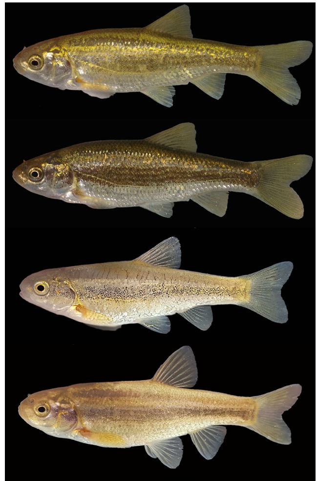
FIGURE 3 Pseudophoxinus firati , from above: male, 75 mm standard length (SL), female, 80 mm SL, spring Yazyurdu; about 40 mm SL, spring Göz; about 55 mm SL, spring Karahalka

Tohma River: The uppermost part of the Tohma River is situated just 1.5 km northeastern of the spring Yazyurdu. The Yazyurdu spring flows just one km south to the Tohma River from where P. firati was found. It is a small, shallow and clear stream with flow slowly. No pollution was observed.