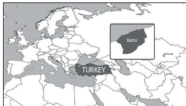
FIGURE 1 Study area in Bartın - Turkey.

With a rural population of 63.8%, Bartın province is much above the Turkish average (22.7%) (Tuik, 2015). Table I shows the forest areas, overall area, the number of forest villages, the total population and the number of beehives in Bartın province (TBMM, 2017; Mara, 2017; OTE, 2017; GDF, 2017a; Tuik, 2015; Gungor; Ayhan, 2016).