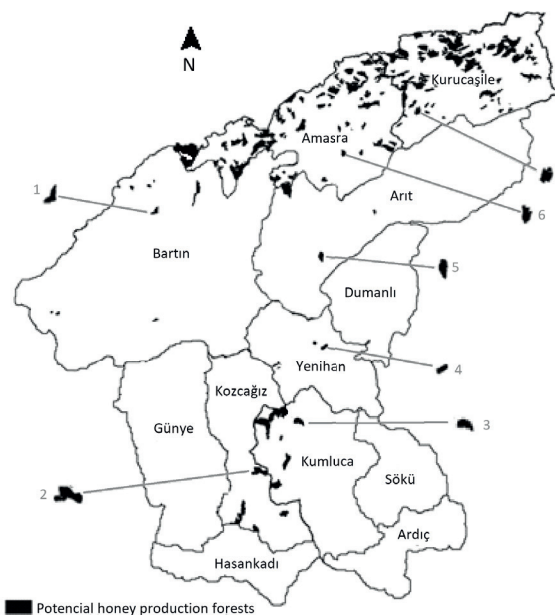
FIGURE 3 Potential honey producing forest areas.

Eight areas producing the highest amount of honey for each FSD were determined. The relevant areas are shown on the map with numbers placed counterclockwise (Figure 4). These areas were taken into consideration to be organized in accordance with the ranking technique.