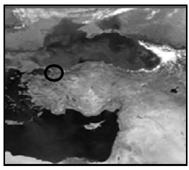
Figure 1. The geographical position of Bartın City

of the study. The depth interviews were conducted by the author with open ended discussions. In order to draw the UA profile determines the level of achieving the needs and demand of the inhabitants.