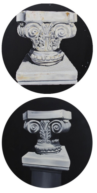
Figure 4. Oil paintings created by students.

When we look at students' works on column heads in the Figure 4, fine workmanship is remarkable at first sight. Light-shade and three-dimension effect on these white-colored column heads placed on a black background were reflected on canvas quite successfully. Marble effect can be felt on these pictures, and in the first picture, we can also see the effect of an artwork extracted under the soil.