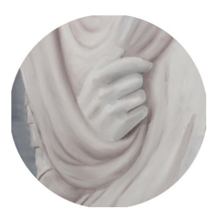
Figure 1. Oil paintings created by students.

In Figure 1, we can see reflections of statues selected by student as subject on their canvas. In the first picture, a certain part of a marble sculpture was drawn. In the study which was placed on canvas in a balanced way, it can be seen that black and white colors are dominant. The picture of the statue placed on a black ground was shaded using gray tones and white color in an attempt to resemble it a marble. In the second picture, the head part of a bronze statue was studied. Unlike the first picture, student here preferred a light background color. To create a bronze-like effect, color preferences were concentrated on brown color and its tones. Shading of the statue head placed in the middle of canvas is very successful. In the third picture, a detailed study was made from a marble statue. In this study, which focuses on the hand of the statue, light colors were dominant. The remarkable point of this study is fabric folds. As we can notice from marble effect in the picture, folds of the fabric were also reflected on the canvas successfully. It can be seen that students, mainly preferring to study a detail of the statue rather than the whole statue, were quite successful on this subject. This is also an indicator of how much students embraced the subject by benefiting from advantages of detail study to achieve their performance and to feel textures of sculptures.