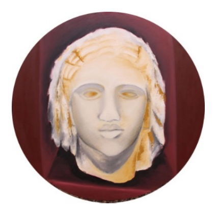
Figure 2. Oil paintings drawn by students.

In Figure 1, we can see reflections of statues selected by student as subject on their canvas. In the first picture, a certain part of a marble sculpture was drawn. In the study which was placed on canvas in a balanced way, it can be seen that black and white colors are dominant. The picture of the statue placed on a black ground was shaded using gray tones and white color in an attempt to resemble it a marble. In the second picture, the head part of a bronze statue was studied. Unlike the first picture, student here preferred a light background color. To create a bronze-like effect, color preferences were concentrated on brown color and its tones. Shading of the statue head placed in the middle of canvas is very successful. In the third picture, a detailed study was made from a marble statue. In this study, which focuses on the hand of the statue, light colors were dominant. The remarkable point of this study is fabric folds. As we can notice from marble effect in the picture, folds of the fabric were also reflected on the canvas successfully. It can be seen that students, mainly preferring to study a detail of the statue rather than the whole statue, were quite successful on this subject. This is also an indicator of how much students embraced the subject by benefiting from advantages of detail study to achieve their performance and to feel textures of sculptures.