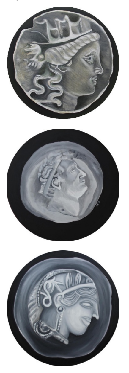
Figure 3. Oil paintings made by students.

student working on a sculpture head used brown and gray tones in shading. To give marble effect and reflection of the light, the students used the color of white and yellow in some works, like the other ones did.