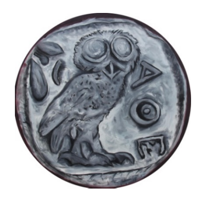
Figure 5.Oil paintings drawn by students

In Figure 5, the first two pictures are oil paintings of stone relief artworks. The artwork seen in the third picture is tombstone. It is possible to see that white and gray tones are dominant also in the third picture. The first picture among those drawn based on relief works was created in a more linear way, and the second one was made in a more dotted way. Stone works placed on a green ground were tried to be depicted by using light-shadow of the work and tones of gray and white colors. While there is a two-dimension perception in studies on relief works, we could perceive three-dimension effect in studies on stone artworks.