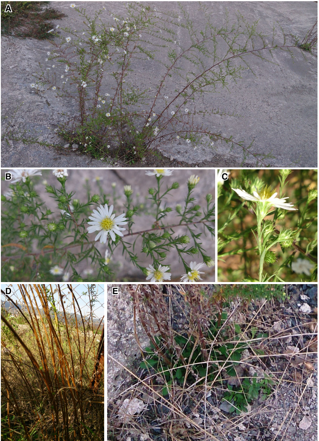
Fig. 1. General appearance of Symphotrichum pilosum var. pilosum : A – habitus; B – inflorescence; C – capitula, D – stem, E – basal leaves (DUOF 7023).