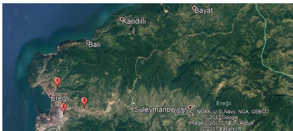
Fig. 3. Distribution of Symphyotrichum in Ereğli district.

areas along the roadsides (Kaul 1975). It was also recently reported as naturalized neophyte for flora of Piemonte in Italy (Conti et al. 2005; Celesti-Grappo et al. 2010). In Europe, this species occurs in different habitats, mostly in agricultural and ruderal, along the coastline, at roadsides, in vine yards, gardens, city parks, on meadows, orchards, trash dumps and roads embankments.