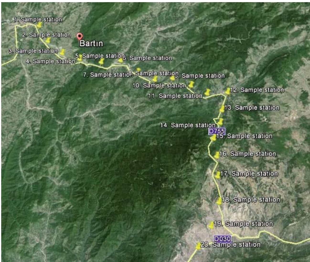
Fig. 1. Distribution of sampling stations throughout D-755 Highway.

In analyses of the data obtained from the experiments on the leaf samples, variance analysis (ANOVA) and