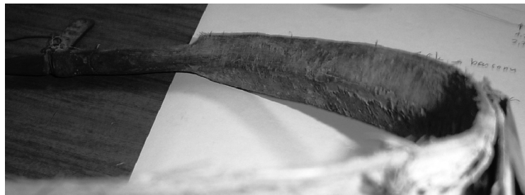
FIGURE 1. The broken arrow with inventory number 2564 in the collection of Izmir Ethnography Museum

A small sample (2 mm \times 7 mm \times 1 mm) from a wooden Ottoman composite archery bow in the collections of Izmir Ethnography Museum was investigated on the basis of wood anatomy. The broken bow ( inventory number 2564 ), which is 114 cm in length and 230 gram in weight, is dated to early 1800s (Figures 1 and 2). Routine procedures were carried out for the preparation of transverse, radial longitudinal and tangential longitudinal sections of small wood sample (Merev 2003; Yaltrık 1971). Microphotographs were taken using light photomicroscope, Zeiss Axiostar-plus. Identification was made using manuals of wood anatomy (Akkemik & Yaman 2012; Fahn et al. 1986; InsideWood 2004-onwards; Merev 1998; Schoch et al. 2004) and comparative thin sections of fresh wood from Turkey.