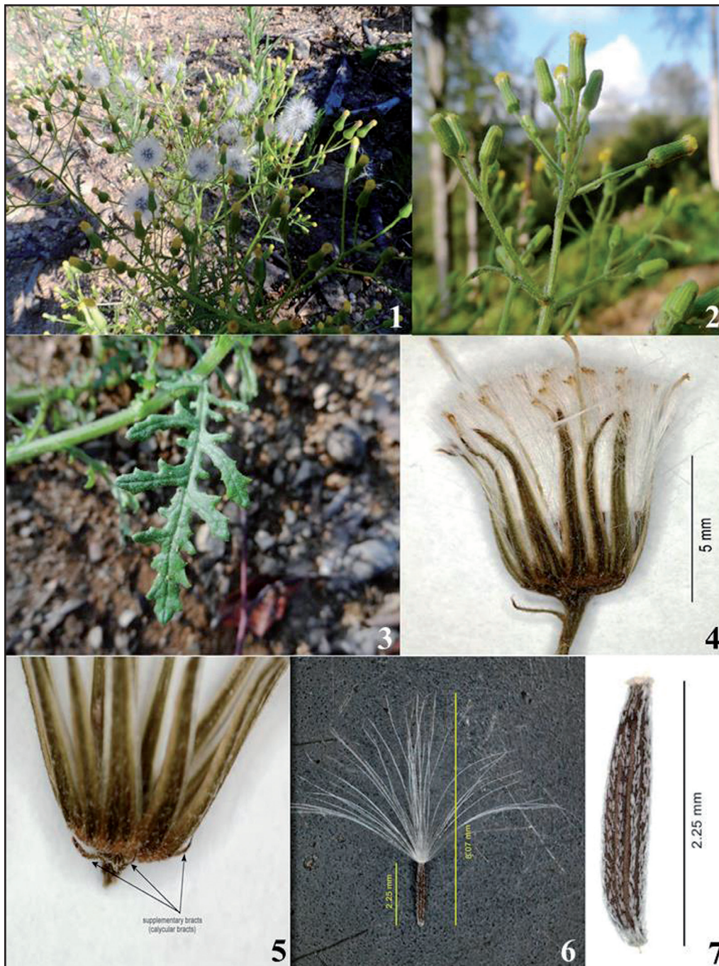
Fig. 1. General appearance of Senecio sylvaticus L.

Location/New localities: Examined specimens of Senecio samples were collected from the western part of the Black Sea Region A3: Zonguldak; Ereğli and Alaplı in the 2014 vegetation period. The samples from Ereğli were collected from Karakavuz location – 1000 m a.s.l., on 22 August, and the samples from Alaplı