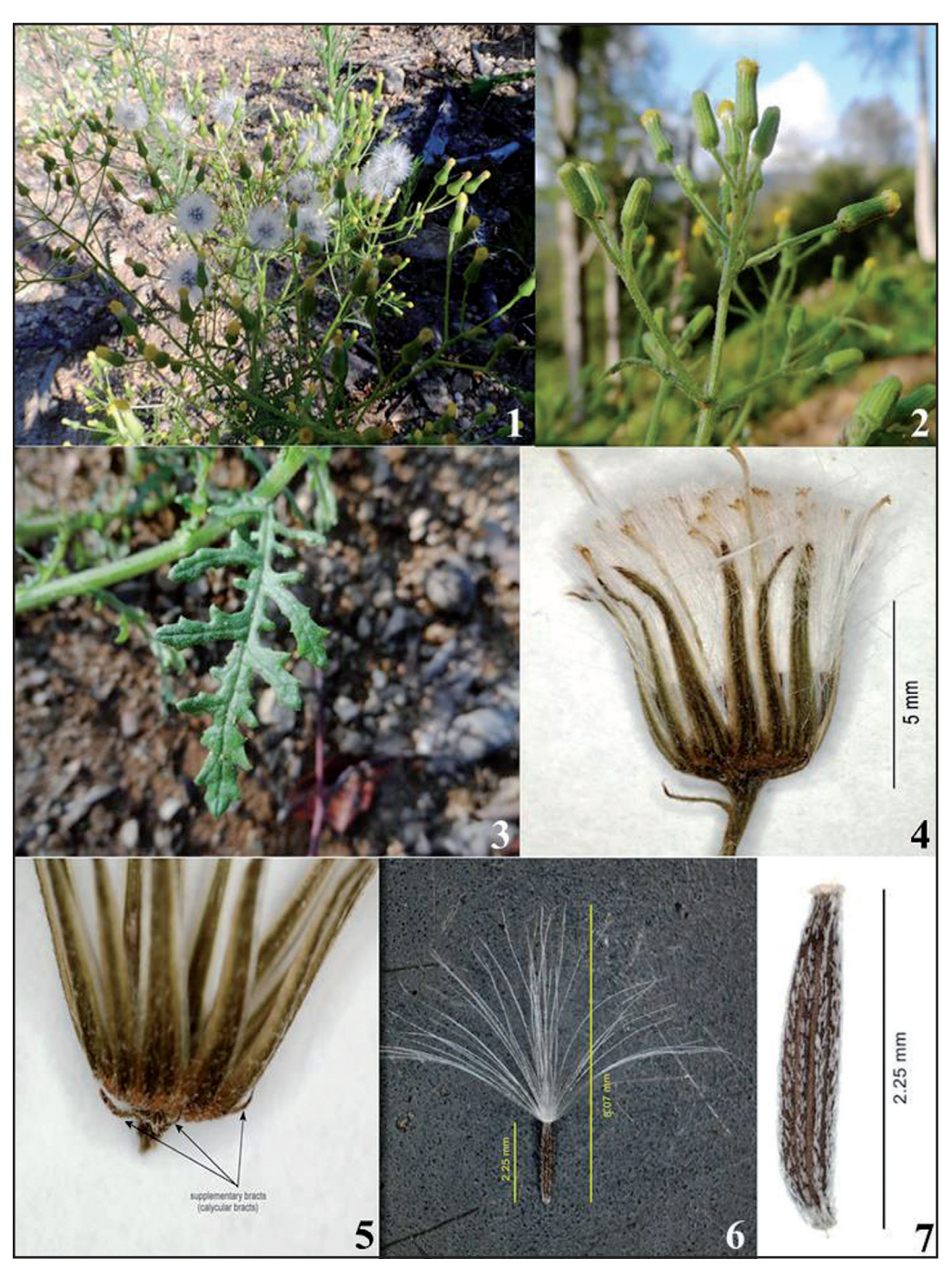
Fig. 1. General appearance of Senecio sylvaticus L.

Wood-margins and disturbed ground, especially on sandy soils. From Central Fennoscandia and North Central Russia southwards to Central Portugal, Central Italy and Bulgaria (cf. Chater & Walters 1976). Location/New localities: Examined specimens of Senecio samples were collected from the western part of the Black Sea Region A3: Zonguldak; Ereğli and Alaplı in the 2014 vegetation period. The samples from Ereğli were collected from Karakavuz location – 1000 m a.s.l., on 22 August, and the samples from Alaplı